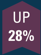
LAKE FOREST & DEERFIELD 10