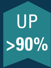
ELMHURST, EVANSTON & PARK RIDGE 10